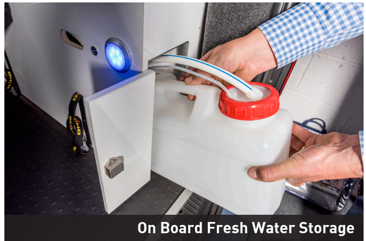
On Board Fresh Water Storage

od lighting. We have taken s and creates a totally different