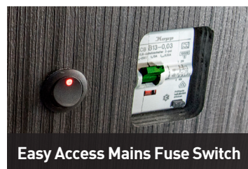
Easy Access Mains Fuse Switch