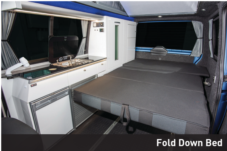
Fold Down Bed