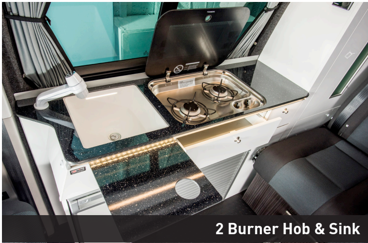
2 Burner Hob & Sink