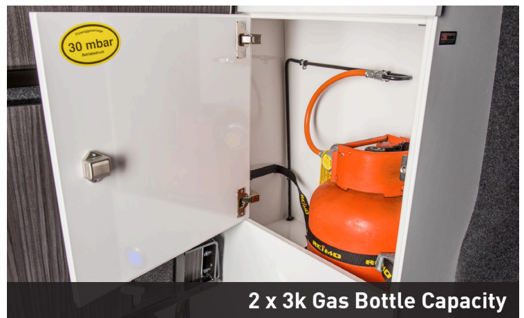
2 x 3k Gas Bottle Capacity