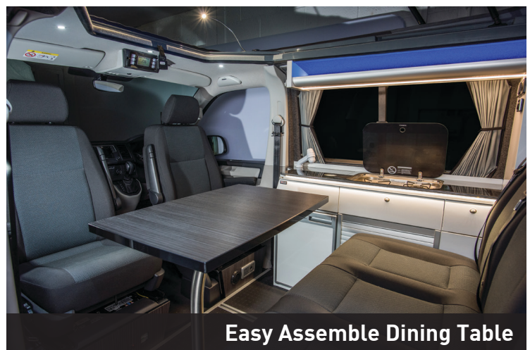
Easy Assemble Dining Table