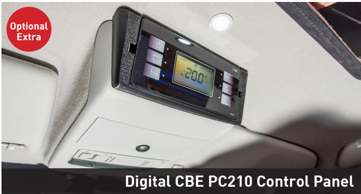
Digital CBE PC210 Control Panel

Under seat storage/load space with removable panel to fit those extra long items neatly down the side of the seat. Our own design and proud of it.