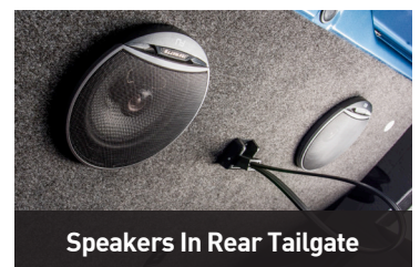
Speakers In Rear Tailgate