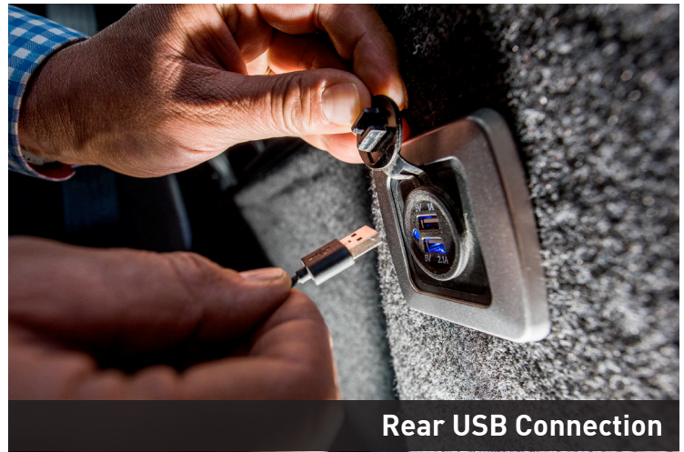
Rear USB Connection