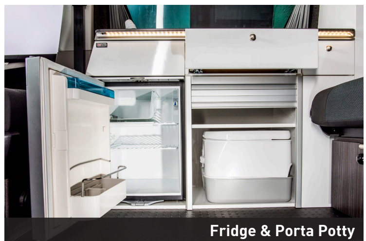
Fridge & Porta Potty